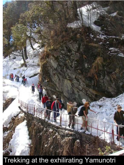
Trekking at the exhilarating Yamunotri

The Yamuna Yatra is a 12-day journey along the banks of the River Yamuna, exploring the ecological, social, cultural, mystical, spiritual and political facets of the river.