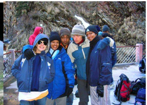
Snapshots of Youth Yatra 2007