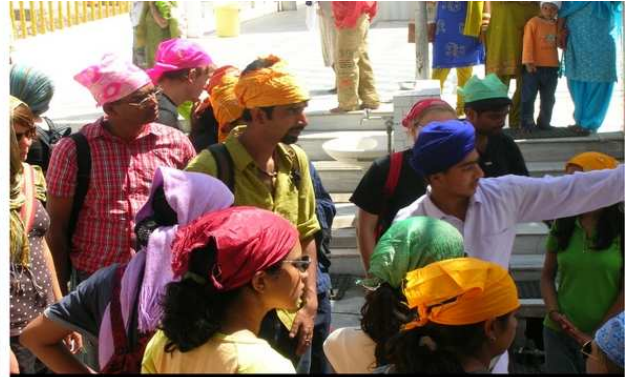
Yatris paying their obeisance at Poanta Sahib Gurudwara

The Yamuna Yatras began in 2004. Over the years, Sweccha has organized six 12-15 day Yamuna Yatras in India . The Yamuna Yatras have become an excellent space for inter-cultural learning and participation which have been supported by various national and international organizations- the US Embassy, the British Council and the European Union.